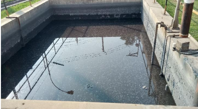
Photo of before treatment area