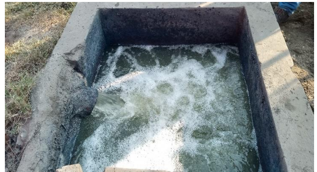
Photo of after treatment area